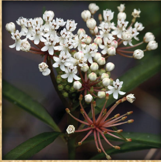
Swamp Milkweed Asclepias perennis