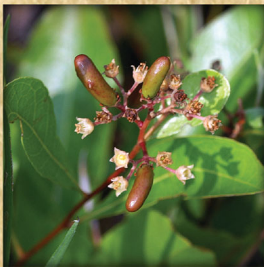
Gopher Apple Licania michauxii