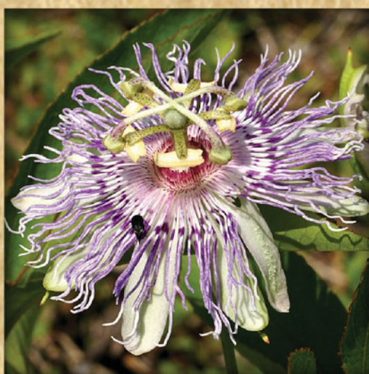
Purple Passionflower Passiflora incarnata

Through its efforts to protect water resources, the Southwest Florida Water Management District buys and manages land. As a result, plants and animals that live on these lands are also protected and the public can enjoy recreational and educational activities in the great outdoors. For a more comprehensive list containing birds, mammals, butterflies, frogs, toads, insects, trees, shrubs, reptiles, wildflowers and natural communities, please visit