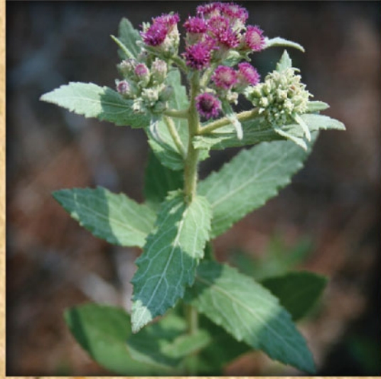
Rosy Camphorweed Pluchea baccharis