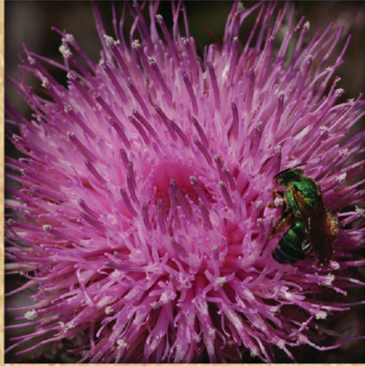
Purple Thistle Cirsium horridulum