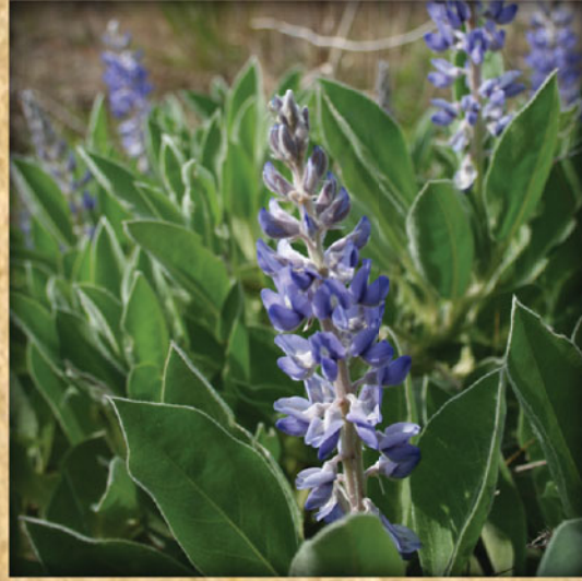
Sky-Blue Lupine Lupinus diffusus