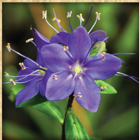
Skyflower Hydrolea corymbosa