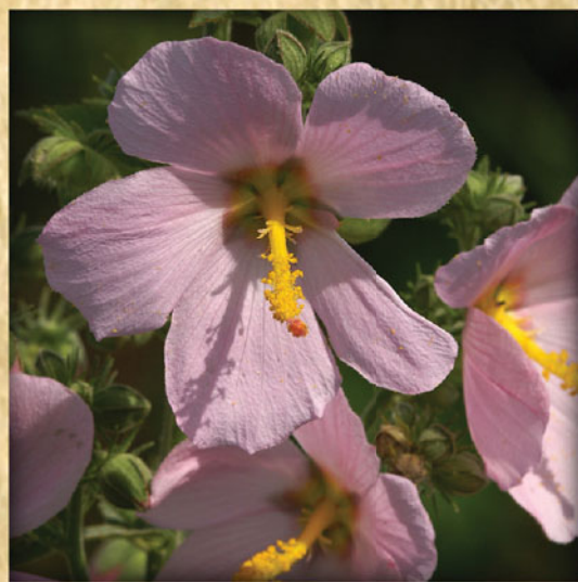
Virginia Saltmarsh Mallow Kosteletzkya pentacarpos