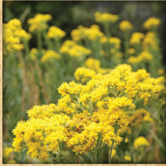
Goldenrod Solidago sp.