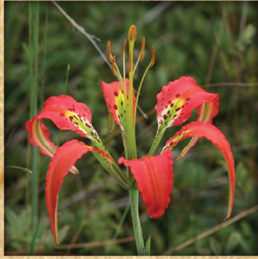
Pine Lily Lilium catesbaei