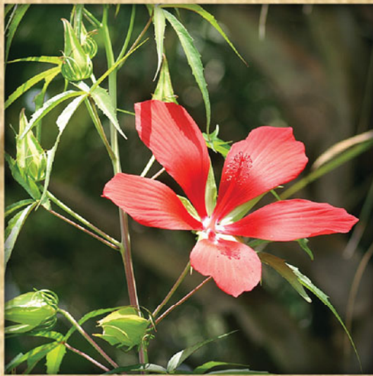
Scarlet Rosemallow Hibiscus coccineus