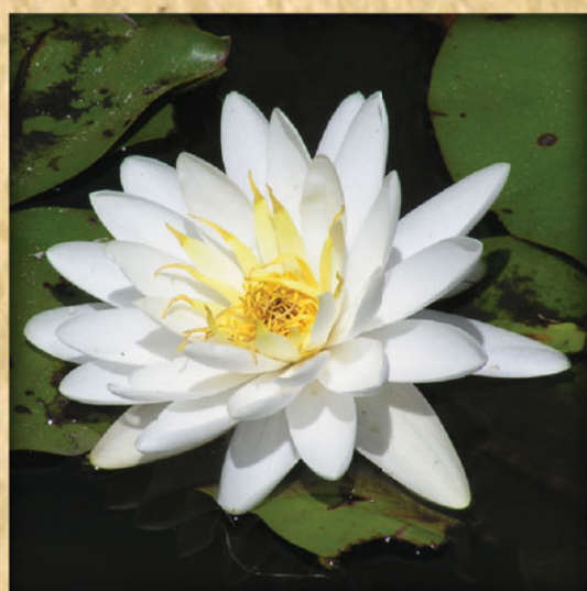
American White Waterlily Nymphaea odorata