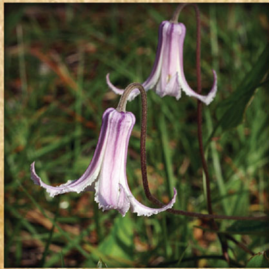
Pine Hyacinth Clematis baldwinii