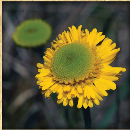
Southeastern Sneezeweed Helenium pinnatifidum