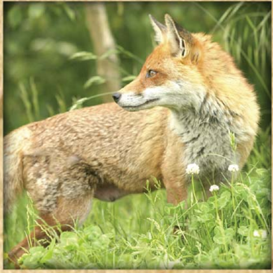
Red Fox Vulpes vulpes