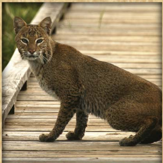
Bobcat Lynx rufus