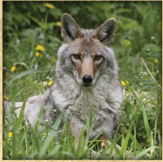
Coyote Canis latrans