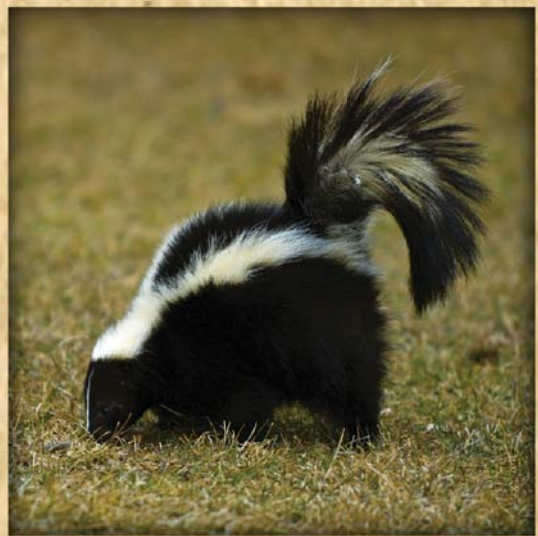
Striped Skunk Mephitis mephitis