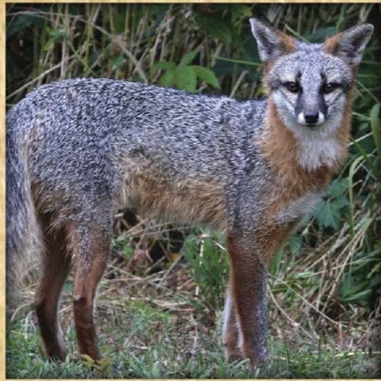
Gray Fox Urocyon cinereoargenteus