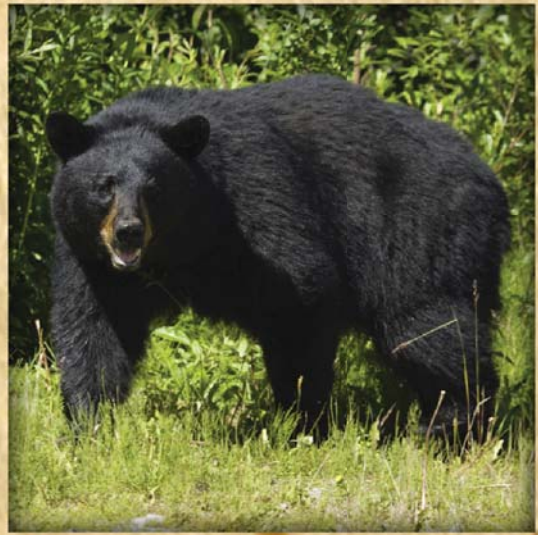
Black Bear Ursus americanus