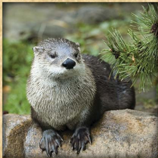
River Otter Lutra canadensis