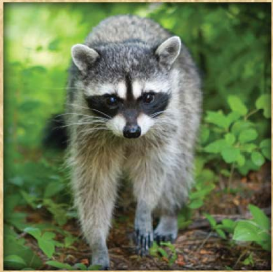
Raccoon Procyon lotor