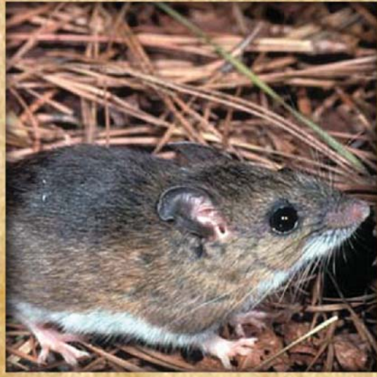
Cotton Mouse Peromyscus gossypinus