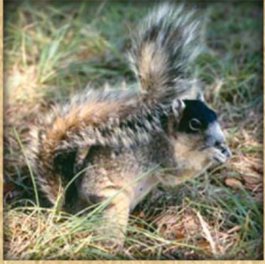
Sherman's Fox Squirrel Sciurus niger shermani