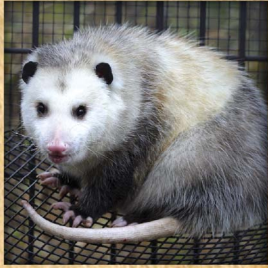
Virginia Opossum Didelphis virginiana