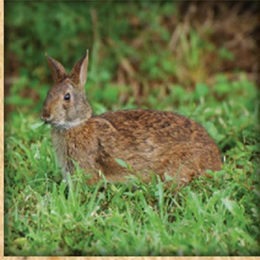
Marsh Rabbit Sylvilagus palustris