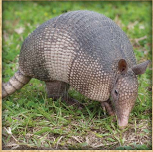
Nine-Banded Armadillo Dasypus novemcinctus