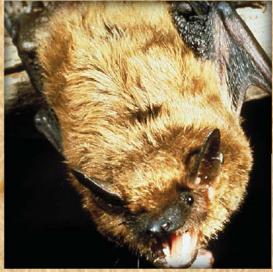
Big Brown Bat Eptesicus fuscus