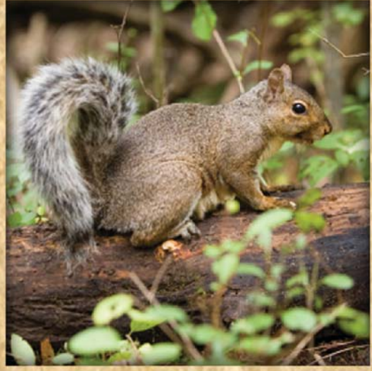
Eastern Gray Squirrel Sciurus carolinensis