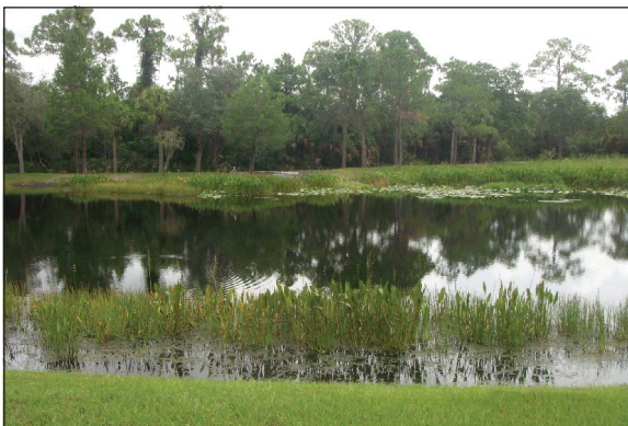
Wet detention pond in Manatee County

A stormwater pond is an artificial pond that is designed to collect, retain and control discharges which are necessitated by rainfall events. These ponds prevent flooding and remove pollutants from the water prior to it draining into the groundwater or into the nearest waterbody.