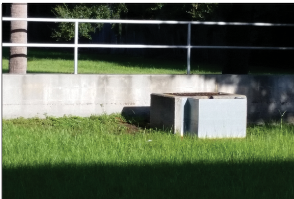
Dry retention pond in Sarasota County

There are different types of stormwater ponds and systems. Some are wet all of the time, and some are dry all of the time. A stormwater control structure can usually be seen along the perimeter of these features.