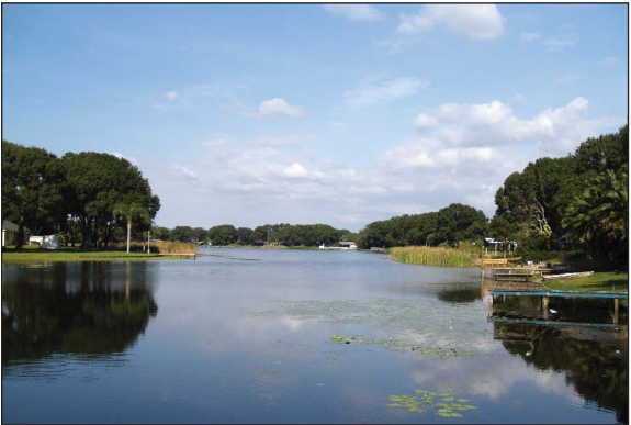
Lake Joyce, Pasco County

A lake is a waterbody surrounded by land that was naturally formed by geologic or stream processes. Lakes provide habitat for a variety of plants and animals. They also filter the water, improve the quality and provide a food source for animals. Most natural lake bodies in Florida also have a proper name.