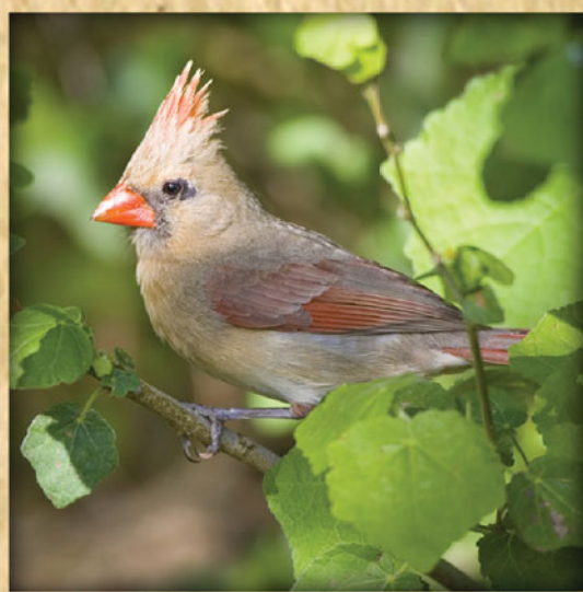
Northern Cardinal ♀ Cardinalis cardinalis female