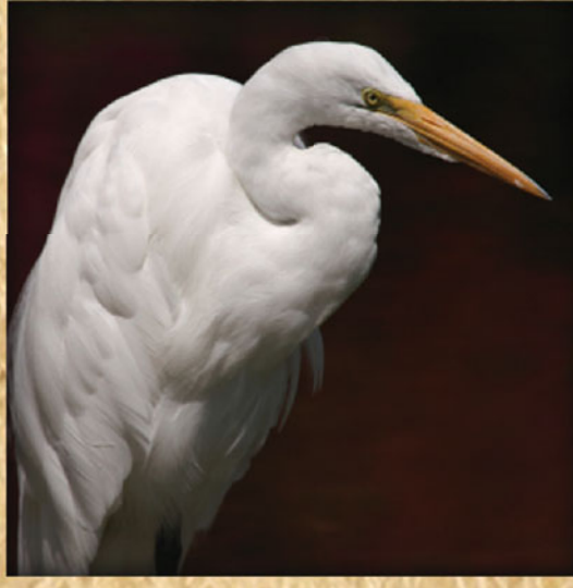
Great Egret Ardea alba