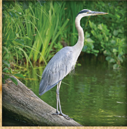
Great Blue Heron Ardea herodias