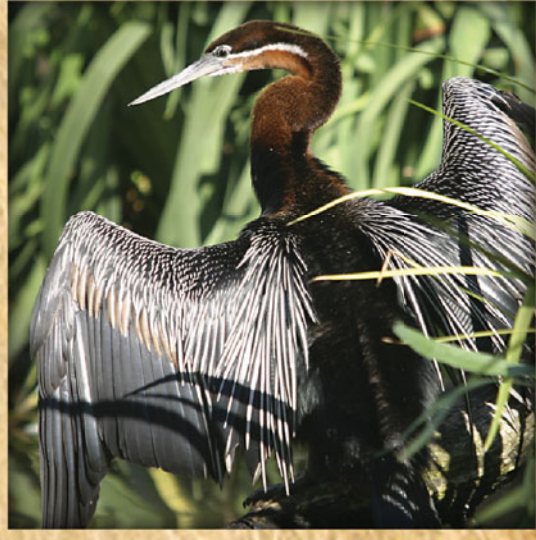
Anhinga Anhinga anhinga