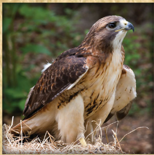
Red-Tailed Hawk Buteo jamaicensis