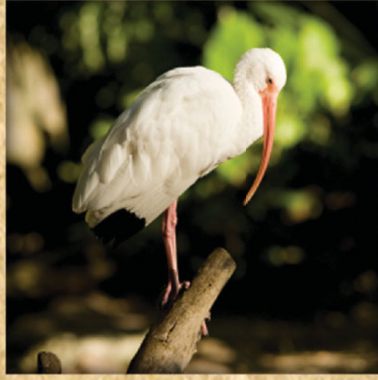
White Ibis Eudocimus albus