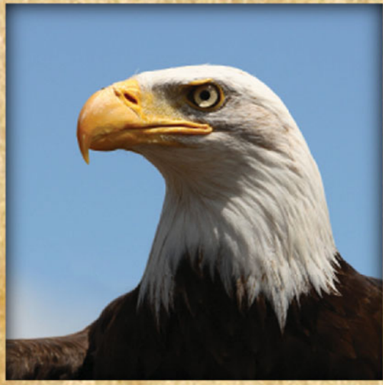
Bald Eagle Haliaeetus leucocephalus