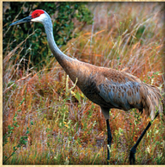
Sandhill Crane Grus canadensis