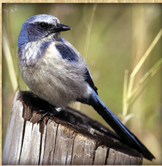
Florida Scrub-Jay Aphelocoma coerulescens