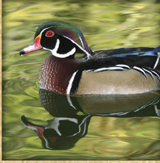
Wood Duck Aix sponsa