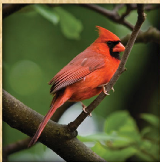
Northern Cardinal ♂ Cardinalis cardinalis male