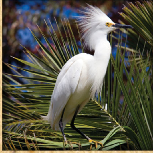
Snowy Egret Egretta thula