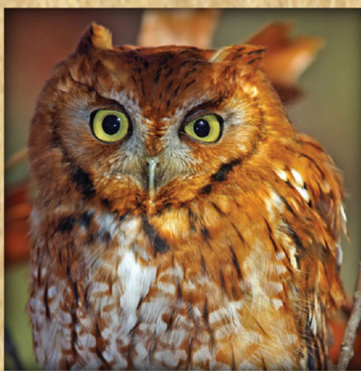
Eastern Screech-Owl Megascops asio