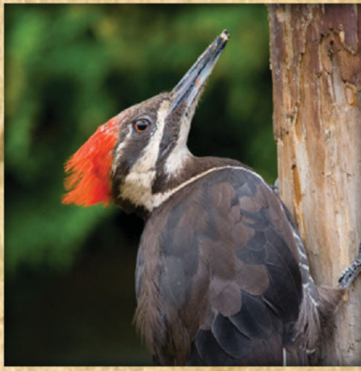
Pileated Woodpecker Dryocopus pileatus