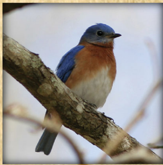
Eastern Bluebird Sialia sialis